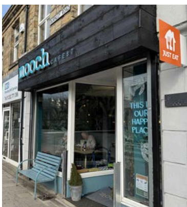
Mooch Cafe87 87 Burnley Road Padiham BB12 8BL