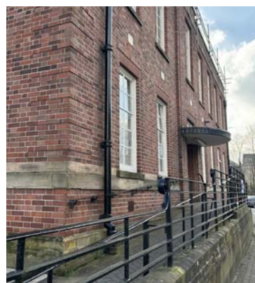
Padiham Library Town Hall, Burnley Road Padiham BB12 8BS