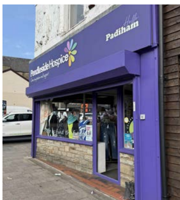
Pendleside Hospice Shop 79 Burnley Road Padiham BB12 8BL