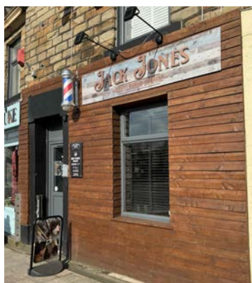
Jack Jones Barbers 91 Burnley Road Padiham BB12 8BL