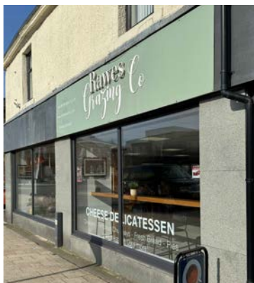
Rawes Grazing Co 105 Burnley Road Padiham BB12 8BL