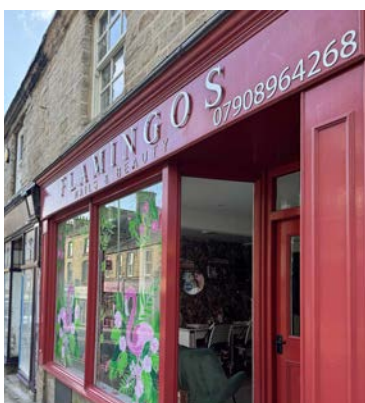
Flamingos Beauty Lounge 10 Burnley Road Padiham BB12 8BX