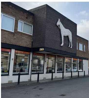
A1 Motorstores 40 Burnley Road Padiham BB12 8BN