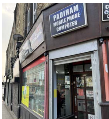
Padiham Mobile Phone & Computers 24 Burnley Road Padiham BB12 8EU