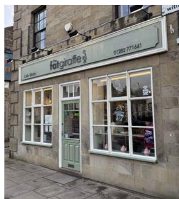
The Fat Giraffe 3 Church Street Padiham BB12 8HF