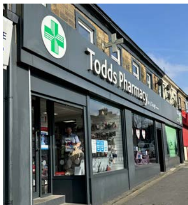
Todd's Pharmacy 135-139 Burnley Road Padiham BB12 8BA

Simply post your design into an entry box in one of the shops below