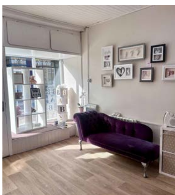
Baby Keepsake Company 23 Burnley Road Padiham BB12 8BY