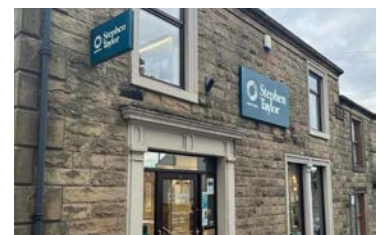
Stephen Taylor Opticians