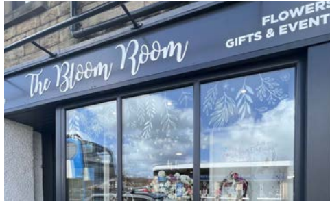
The Bloom Room