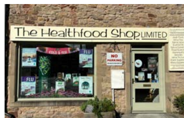
The Health Food Shop