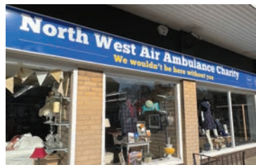
North West Air Ambulance