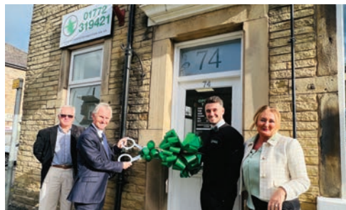
Pendle Hill Properties