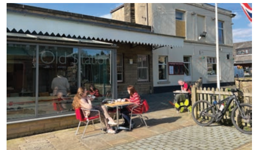
The Old Station Café

Old Station Building Berry Lane, Longridge PR3 3JP