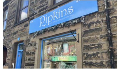
Pipkins Gift & Clothing Shop for Little Ones