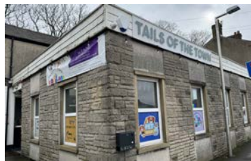
Tails of the Town Pet Shop

Old Station Building Berry Lane, Longridge PR3 3JP